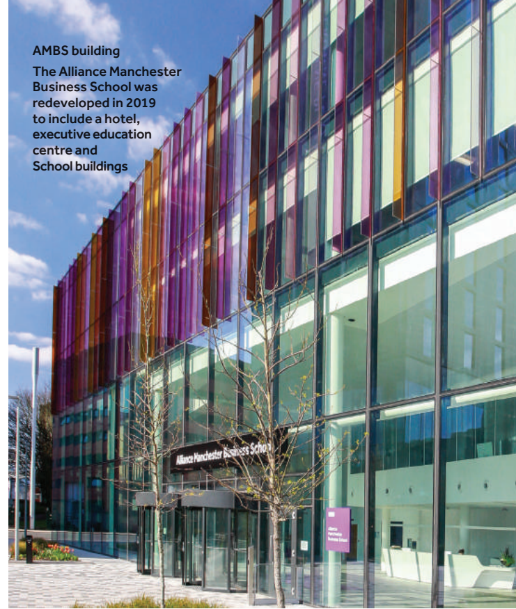
AMBS building The Alliance Manchester Business School was redeveloped in 2019 to include a hotel, executive education centre and School buildings