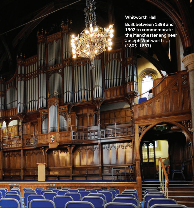
Whitworth Hall Built between 1898 and 1902 to commemorate the Manchester engineer Joseph Whitworth (1803–1887)