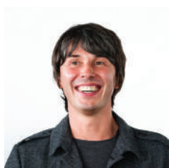
Professor Brian Cox OBE | Professor of Particle Physics, The University of Manchester

As a world-renowned physicist and cosmologist known for his television and radio appearances promoting science, Professor Brian Cox is often at the heart of the media. Drawing on his experience of bringing science to the masses through TV and live events, he will explore the role that universities have in driving innovation and progress, and what they can do to engage further with the public and in particular, local communities, to make them aware of this role.