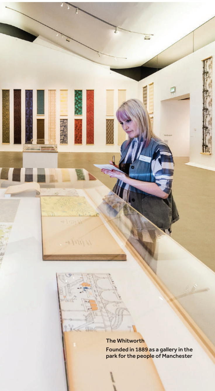
The Whitworth Founded in 1889 as a gallery in the park for the people of Manchester