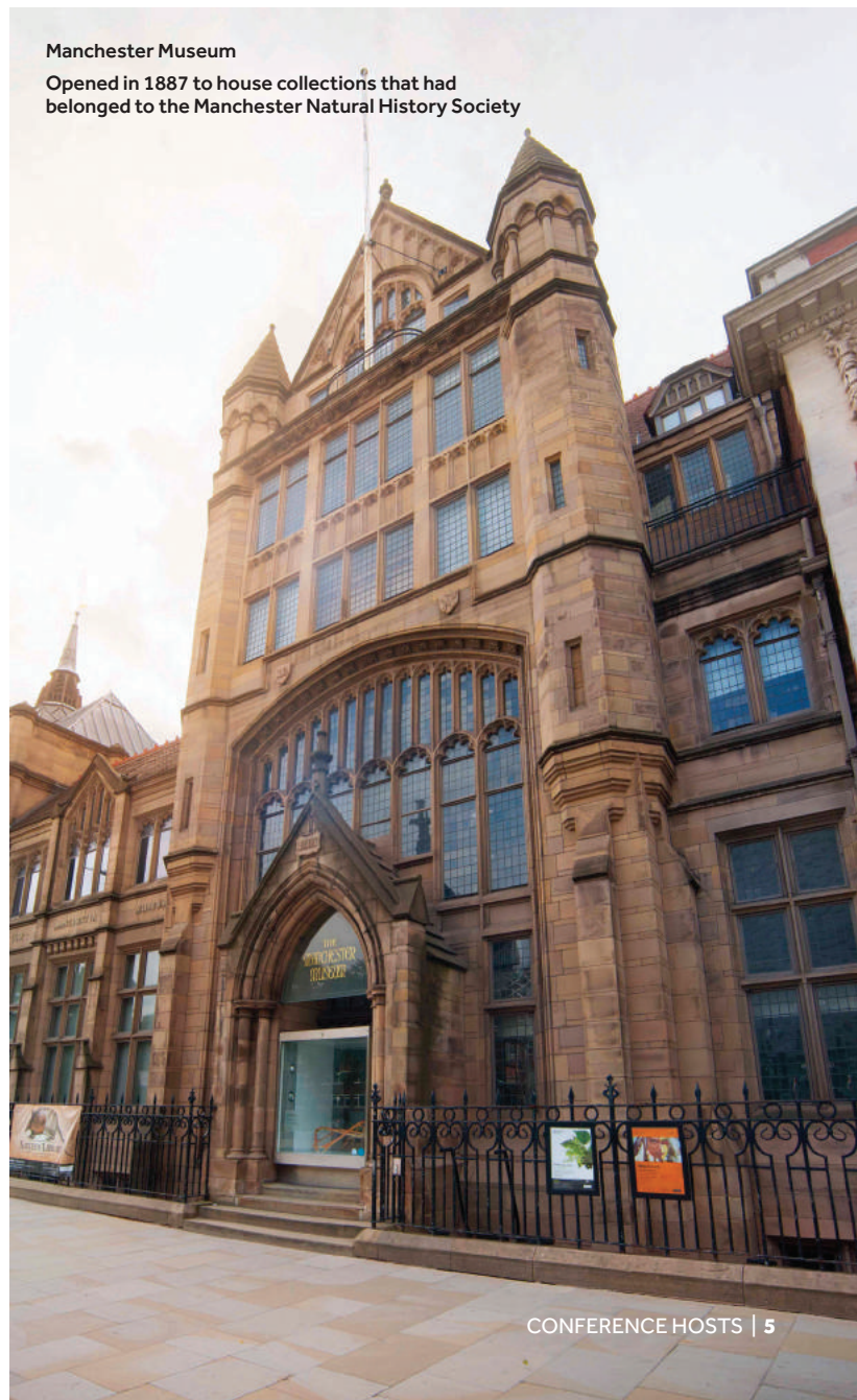
Manchester Museum Opened in 1887 to house collections that had belonged to the Manchester Natural History Society